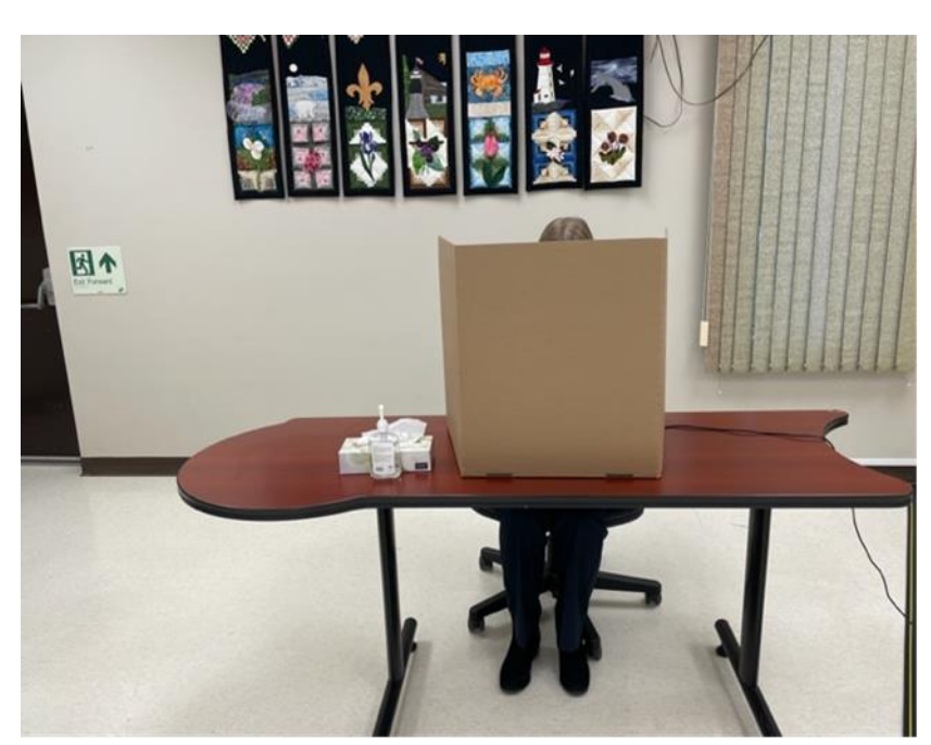
The voting stations were setup for ease of access to each station while providing privacy while the voter finalized their voting.

Council approved internet/telephone voting for the 2022 Municipal Election allowing all electors to vote safely and comfortably from their homes. A Voter Help Centre was setup and was available for people who require assistance casting their ballot in person. Positive feedback was received from some of our residents and visitors for this option.