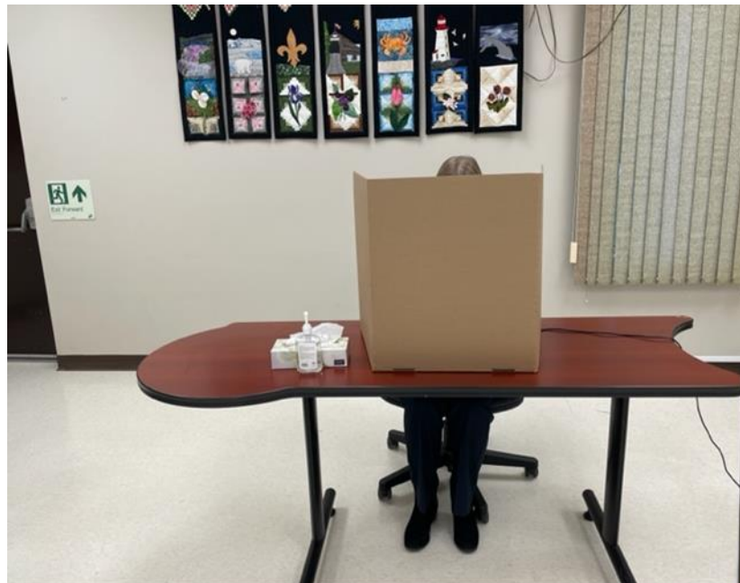
The voting stations were setup for ease of access to each station while providing privacy while the voter finalized their voting.