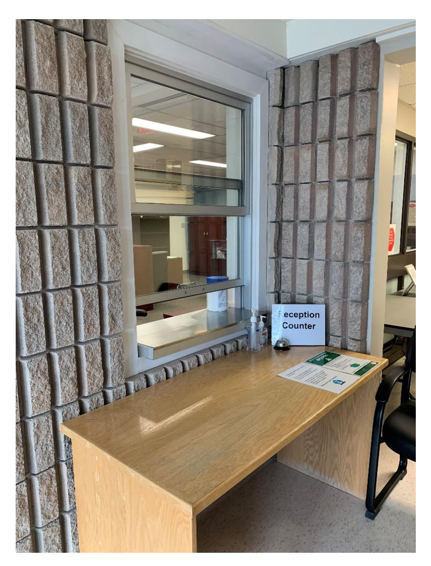
Accessible reception counter at the Municipal Office