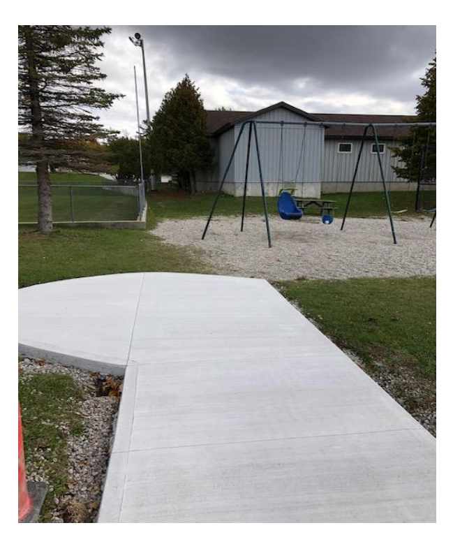
Accessible bucket swing and extended accessible sidewalk at the School Bell Park in Tobermory