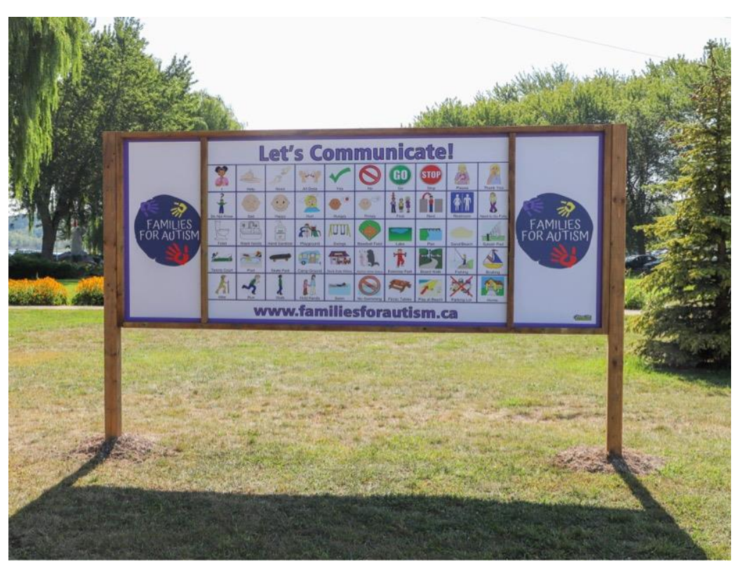
Communication board example, communication boards are scheduled for installation in 2022 at the Lion's Head Beach Park and downtown Tobermory area