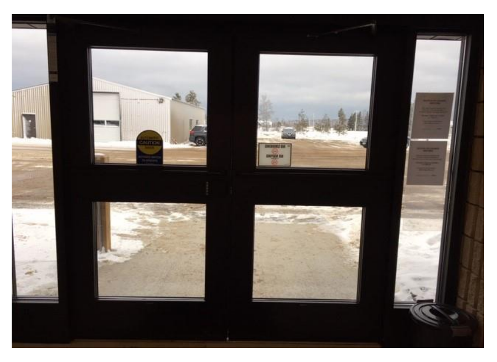
New front doors with automatic door openers at the Municipal Office