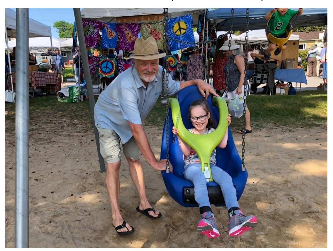
Accessible bucket swing at the Lion's Head Beach Park